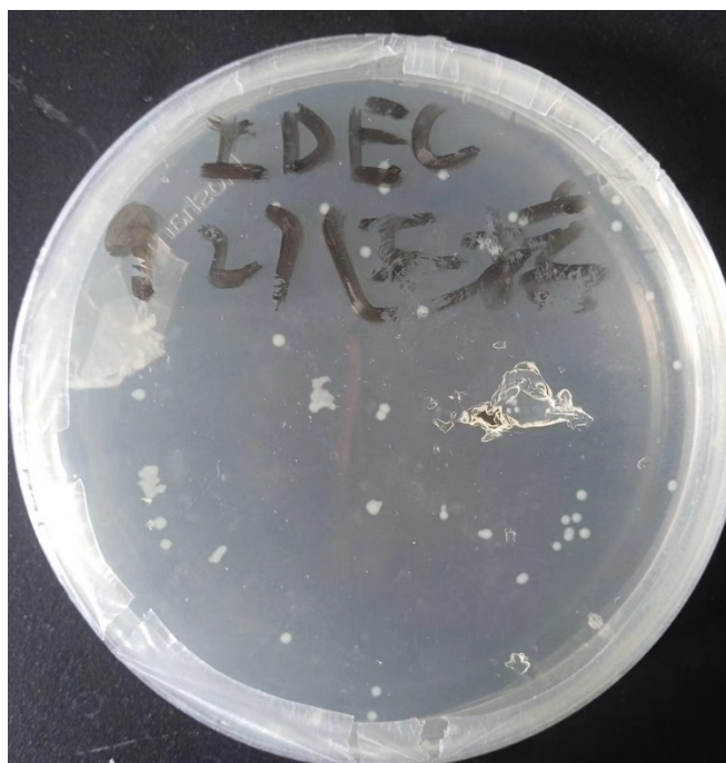
Fig1 The transformation results

Amp-free LB medium was added. The bacteria were then incubated in a constant temperature shaker with oscillation at 37°C and 150 rpm for 45 minutes. A 45-minute incubation period is required for the bacterium to revive and for the resistance gene to be expressed. Centrifugation at 2500 g for 5 minutes is then performed, after which the supernatant of 900µL is aspirated. The bacterium is then resuspended in the remaining medium and spread uniformly on the resistance plate with a sterile applicator stick. Once the bacterial liquid has been absorbed by the plate, it is incubated inverted at 37°C overnight. At the same time, the unmutated wild-type bacterial fluid is used to delineate the control group.